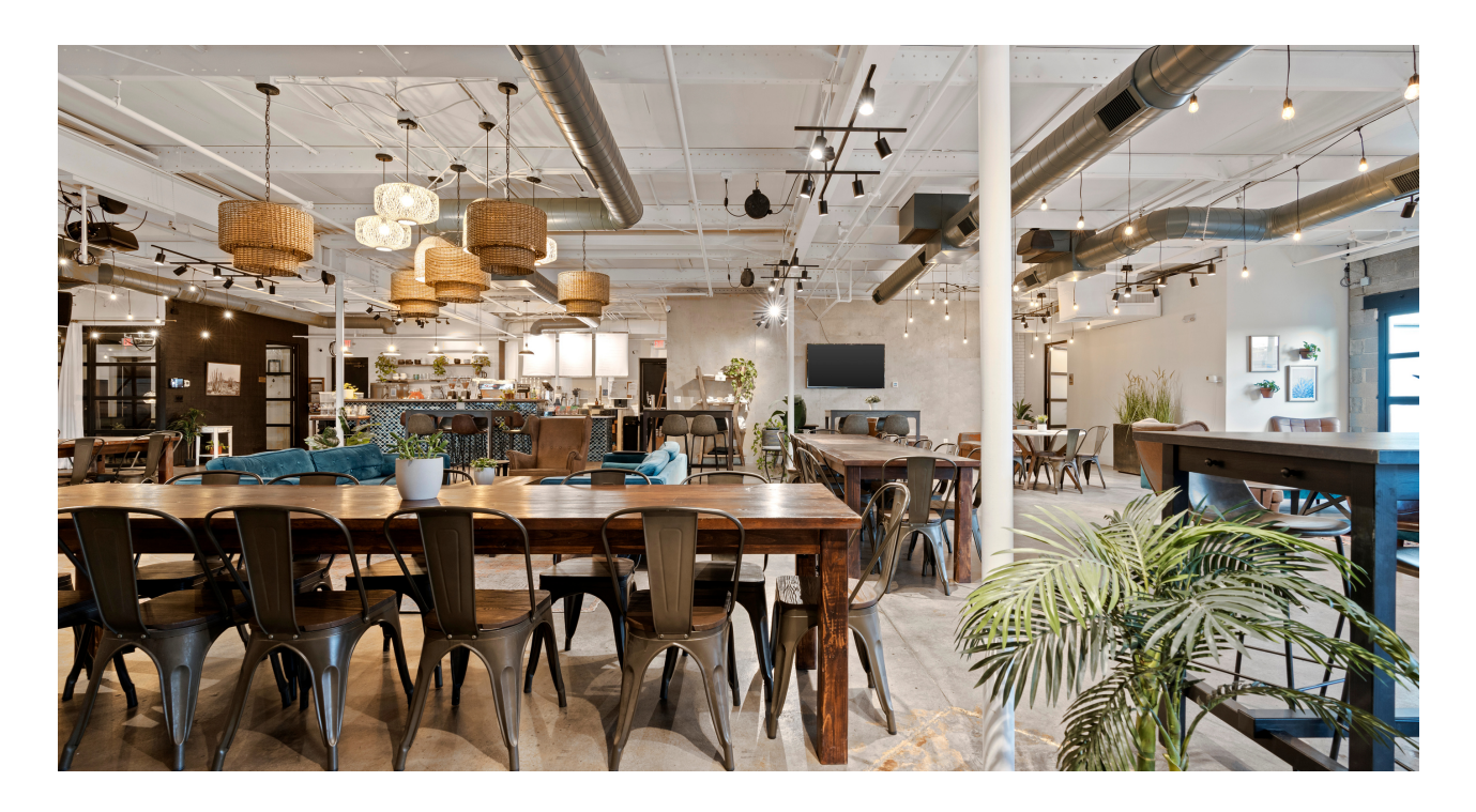
Capacity of 150 people Personalized and tailored for your needs

Our venue seamlessly transforms into an exceptional event space. Versatility allows us to host anything from intimate gatherings to corporate functions. Our adaptable layouts and space set the stage for memorable celebrations and successful events, while our dedicated team ensures every detail is perfectly executed.